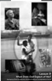
Lesson 9 What Does God Expect of Me? Apologetics Press Introductory Christian Evidence Correspondence Course