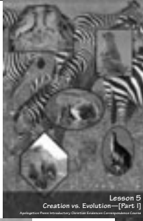
Lesson 5 Creation vs. Evolution—[Part 1] Apologetics Press Introductory Christian Evidence Correspondence Course