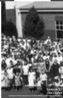
Lesson 10 The Church Apologetics Press Introductory Christian Evidence Correspondence Course