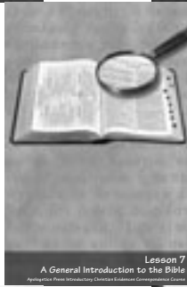
Lesson 7 A General Introduction to the Bible Apologetics Press Introductory Christian Evidence Correspondence Course