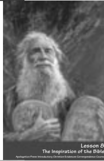
Lesson 8 The Inspiration of the Bible Apologetics Press Introductory Christian Evidence Correspondence Course