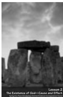
Lesson 2 The Existence of God—Cause and Effect Apologetics Press Introductory Christian Evidence Correspondence Course