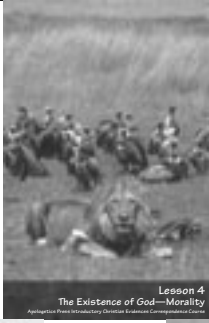
Lesson 4 The Existence of God—Morality Apologetics Press Introductory Christian Evidence Correspondence Course