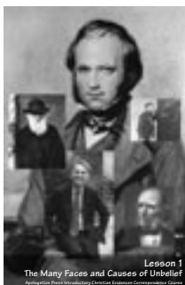
Lesson 1 The Many Faces and Causes of Unbelief Apologetics Press Introductory Christian Evidence Correspondence Course