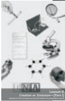
Lesson 6 Creation vs. Evolution—[Part 2] Apologetics Press Introductory Christian Evidence Correspondence Course